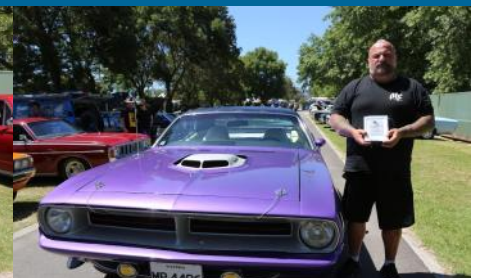
1970 Plymouth Barracuda