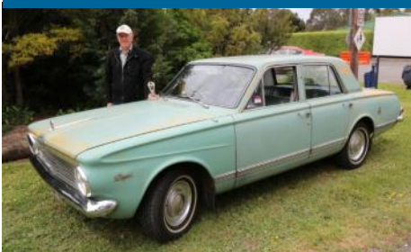
Geoff Sparkes, 1965 AP5 Valiant Best AP5-AP6-VC