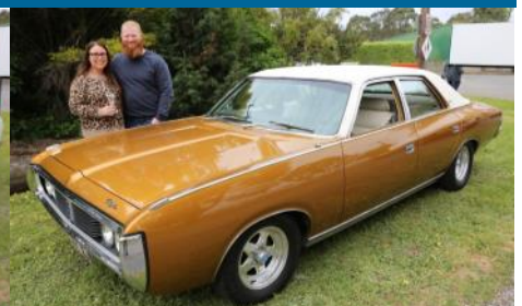
Paige Gardam, 1975 CxC Hardtop Best VH-VJ-VK