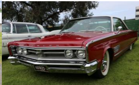
Tom Galea, 1966 Chrysler 300 Best 1961-68